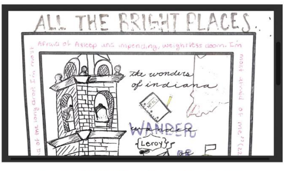
Even MORE One-Pager Examples